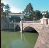
The Imperial Palace